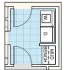
MUD BENCH IPO COAT CLOSET