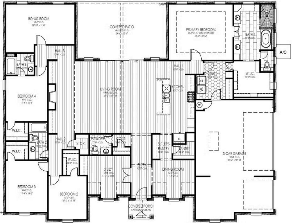
FLOOR PLAN - A ELEVATION SCALE: 1/8" = 1'-0"