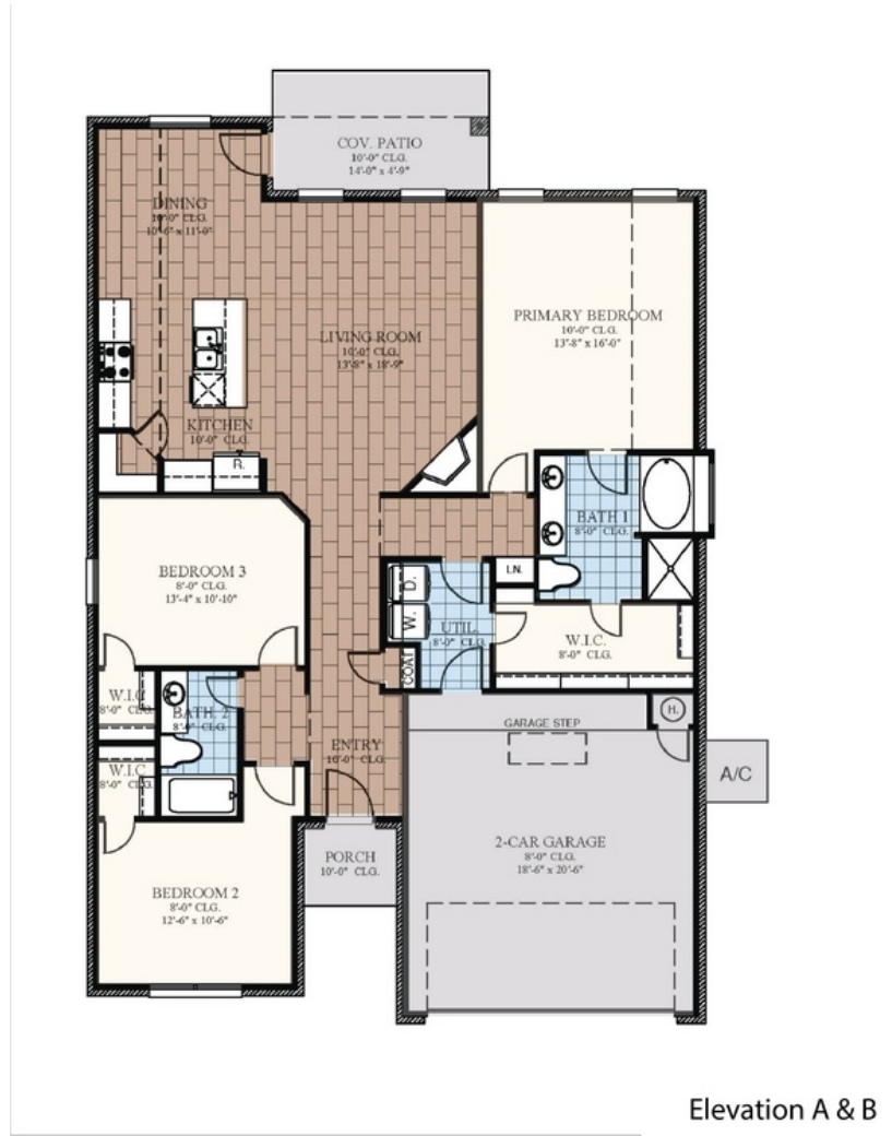
Elevation A & B

Floor Plan: Taylor Square Feet: 1,689 (m.o.l.) Bedrooms: 3 Bathrooms: 2.0 Garage: 2 Car