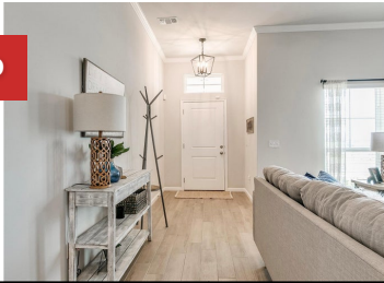
Photos are of previously built floor plan. Colors/options will vary.

8509 NW 77th Place Oklahoma City, OK 73132