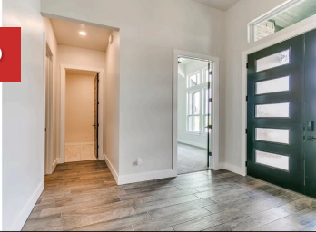
Photos are of previously built floor plan. Colors/options will vary.