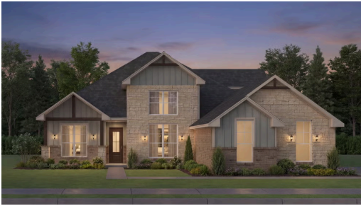
Elevation B - Dusk