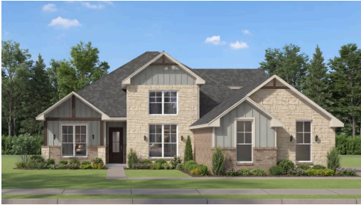
Elevation B - Day